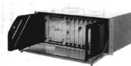
Fig. 3. Test Plug and Card Extender Inserted into relay.